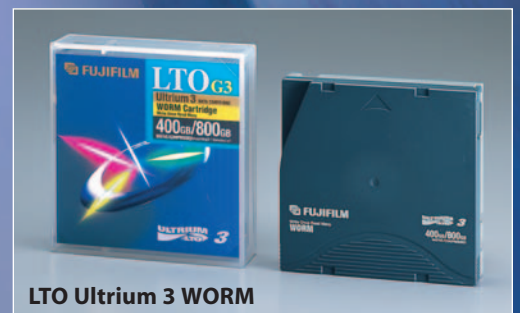
LTO Ultrium 3 WORM